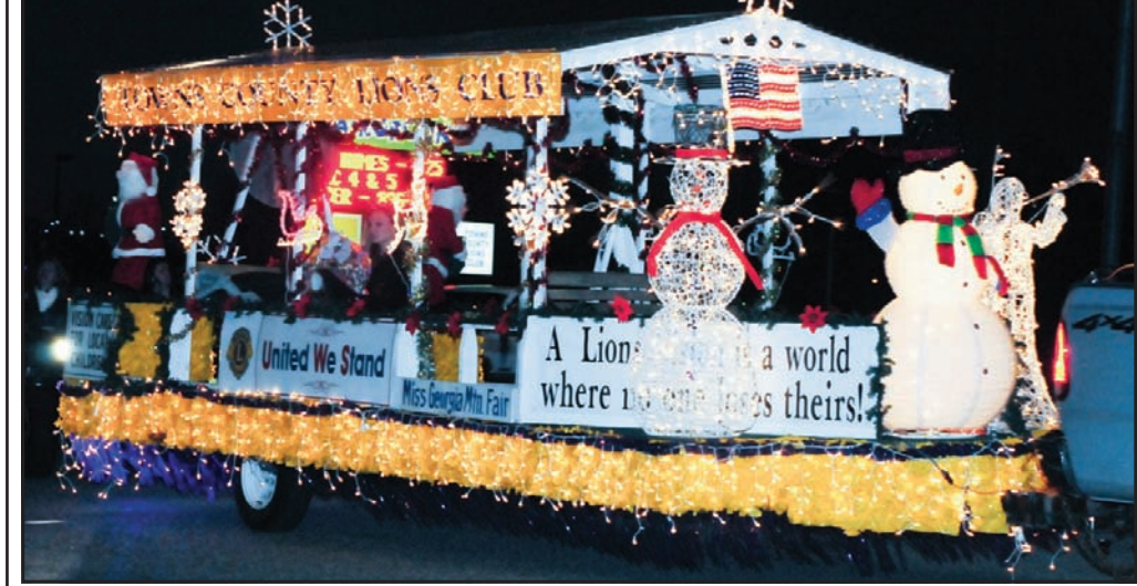
A view from a past Sheriff's Office Christmas Parade.